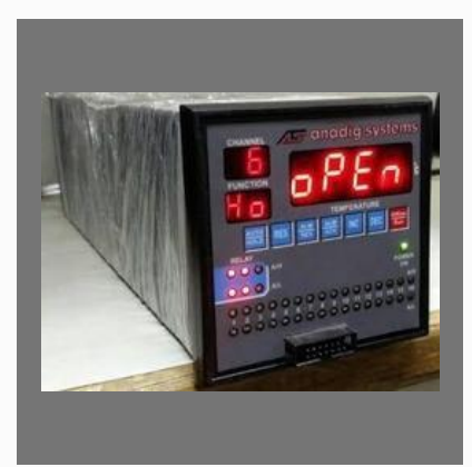
16 Channel Temperature Scanner with Data Logging Software