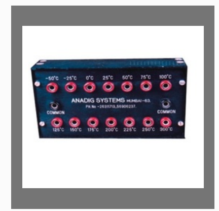
Pt-100,pt-46 Decade Box For Temperature Calibration