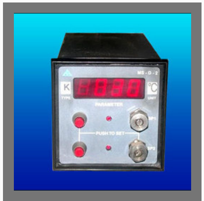
Digital Temperature Indicator Cum Controller