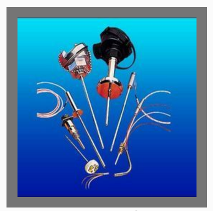
RTD Temperature Sensors