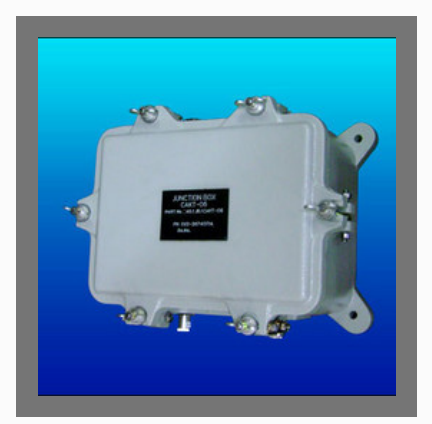
Waterproof Junction Box