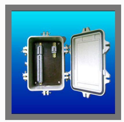
Electrical Junction Box