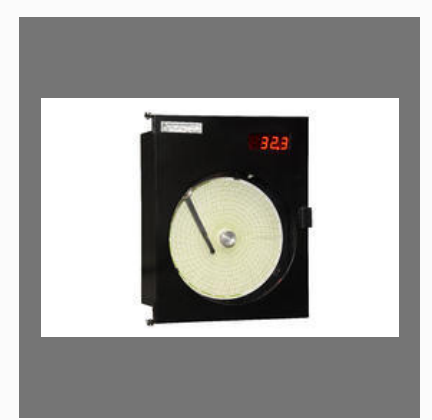
Temperature Graph Recorder