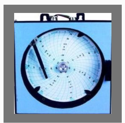
Temp/ Flow/ Pressure/ Vibration Circular Chart Recorder