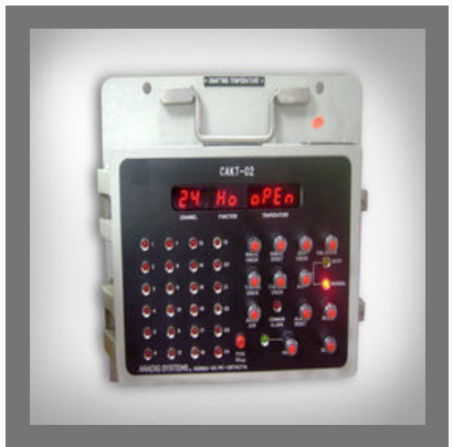
Bearing Temperature Monitoring System