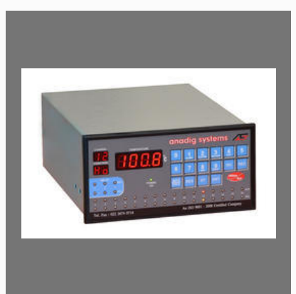
12 Channel Temperature Scanner