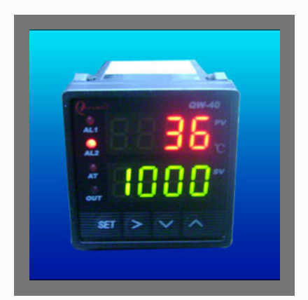
PID Temperature Controllers