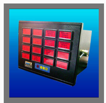
Alarm Annunciation System