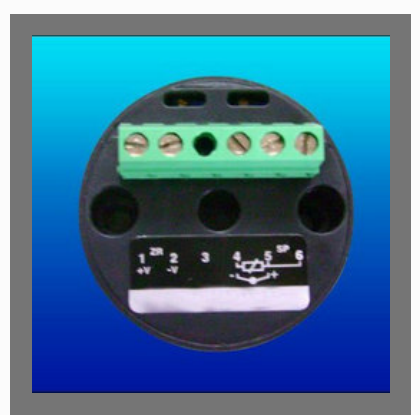
Two Wire Temperature Transmitter