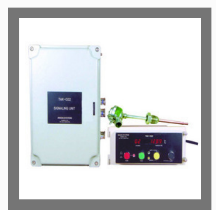
Electronic Temperature Monitoring System