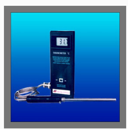
Portable Digital Thermometer