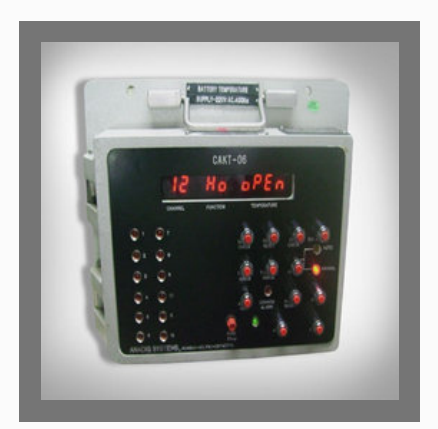
Battery Temperature Monitoring System