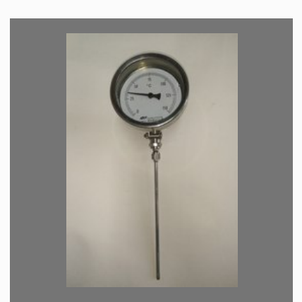
Field Mounted Analog Temperature Indicator