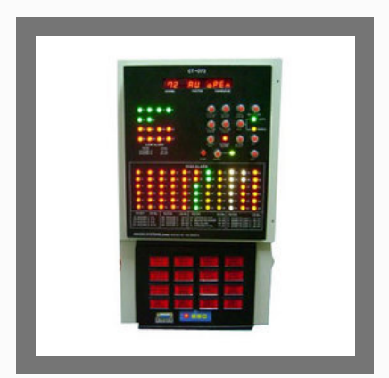
Temperature Scanner With Alarm Annunciator System