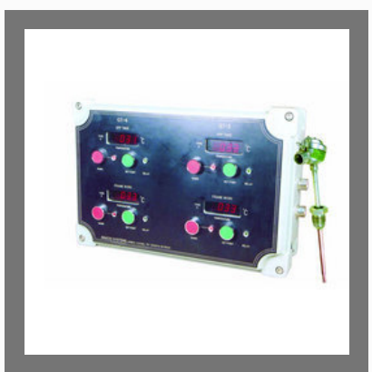
Digital Temperature Monitoring System