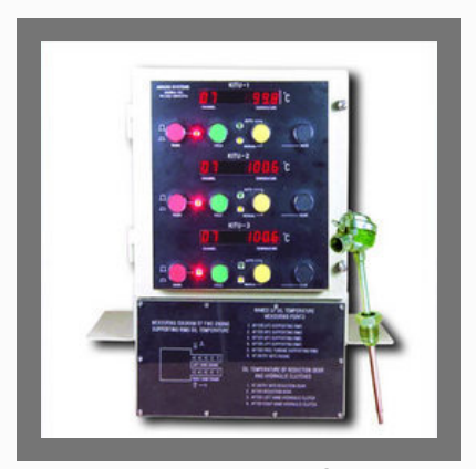
Digital Temperature Scanner