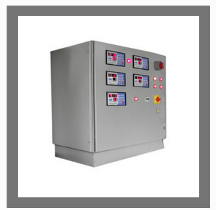
Process Control Panel