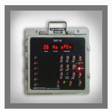
Temperature Monitoring System