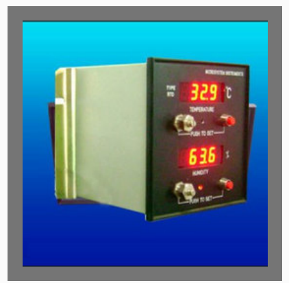
Microcontroller Based Digital Indicator