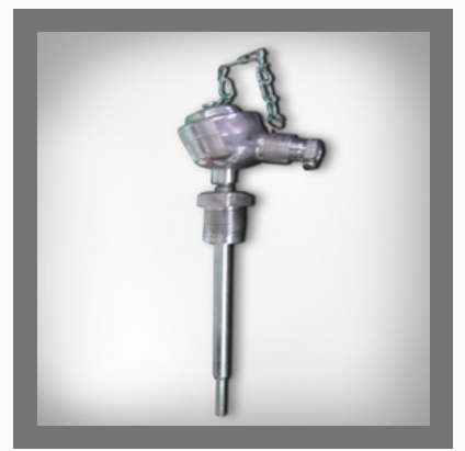
RTD Temperature Sensor