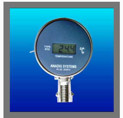
Field Mounted Digital Temperature Indicator